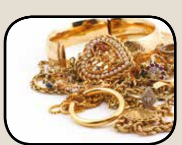
GOLDSMITHING Refining, electrolytic and hollowing plants.